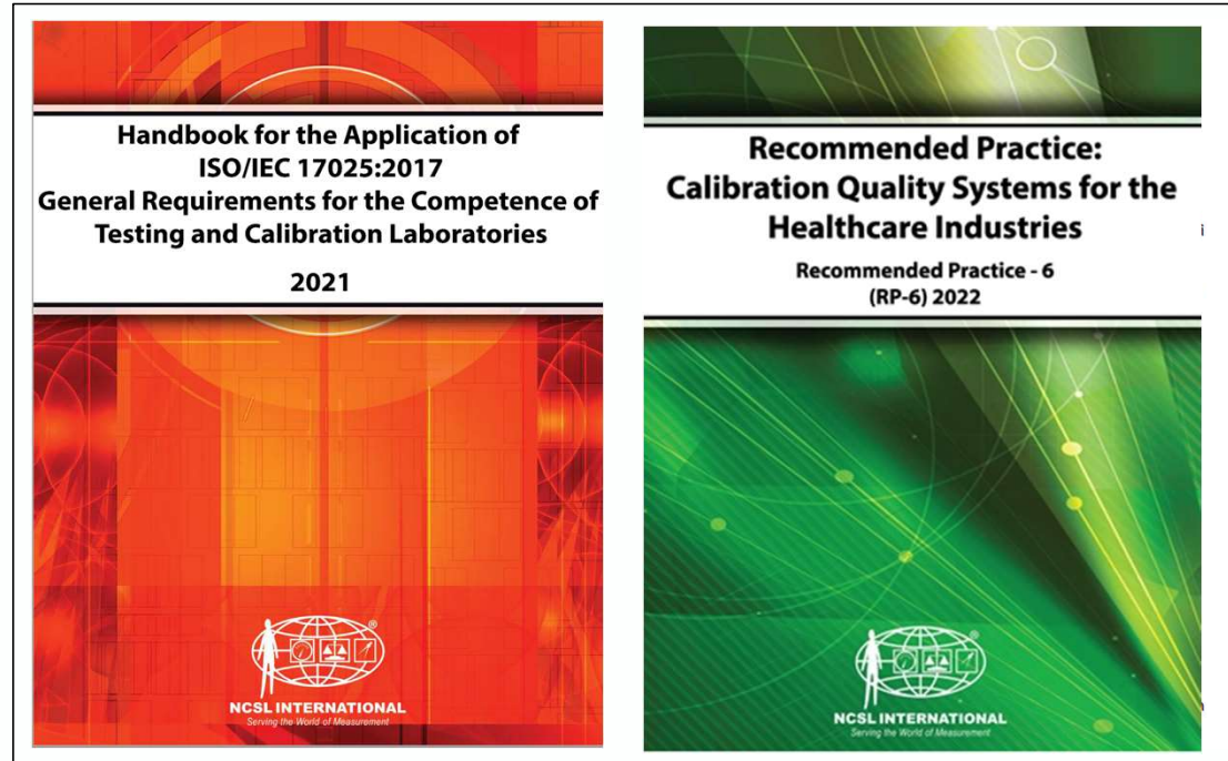
Handbook for the Application of ISO/IEC 17025:2017